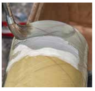
5. Apply thin layer of adhesive (see Adhesive Kits table).