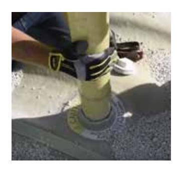
8. Thread Riser Pipe assembly into tank top fitting.

National Oilwell Varco has produced this brochure for general information only, and it is not intended for design purposes. Although every effort has been made to maintain the accuracy and reliability of its contents, National Oilwell Varco in no way assumes responsibility for liability for any loss, damage or injury resulting from the use of information and data herein nor is any warranty expressed or implied. Always cross-reference the bulletin date with the most current version listed at the web site noted in this literature.