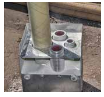
2. Taper riser pipe. Verify taper and re-taper if necessary (see Average Taper Dry-Insertion Length table).