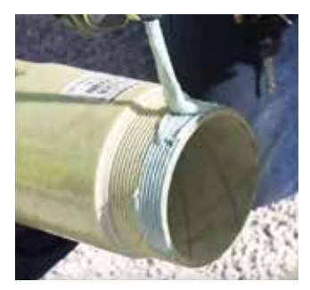
7. Apply thread dope to adapter threads.