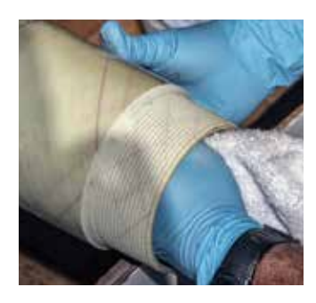
6. Check ID of joint for adhesive overflow, wipe away excess.