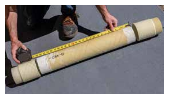
3. Verify overall length of assembly by dry-fitting on tank top. Prep joint surfaces.