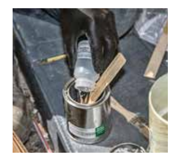
4. Mix adhesive.