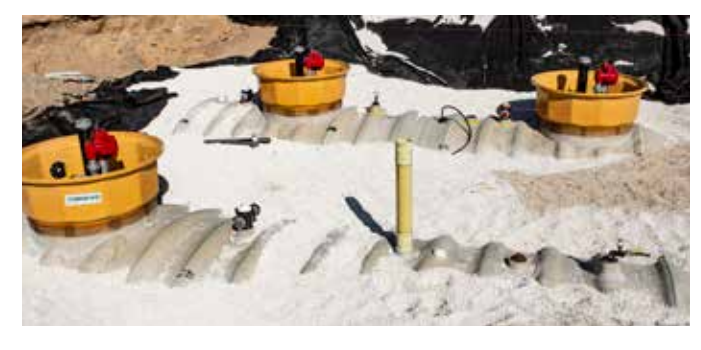
Red Thread IIA Riser Pipe Assembly